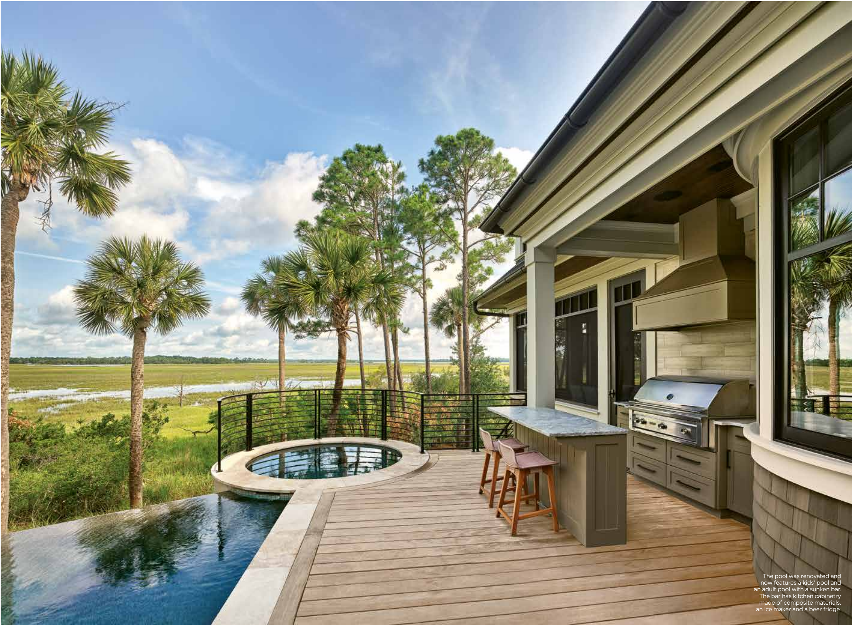
The pool was renovated and now features a kids' pool and an adult pool with a sunken bar. The bar has kitchen cabinetry made of composite materials, an ice maker and a beer fridge.

built-in cabinets and drawers, and a coffee station. Built-in bookcases, cabinets and shoe cubbies line the halls. This floor has guest rooms and a bunk room with three beds and a kid-friendly living room. Here are more thoughtful details: Custom stairs leading to the top bunk have pullout storage, and wall niches have built-in lights for late-night reading.