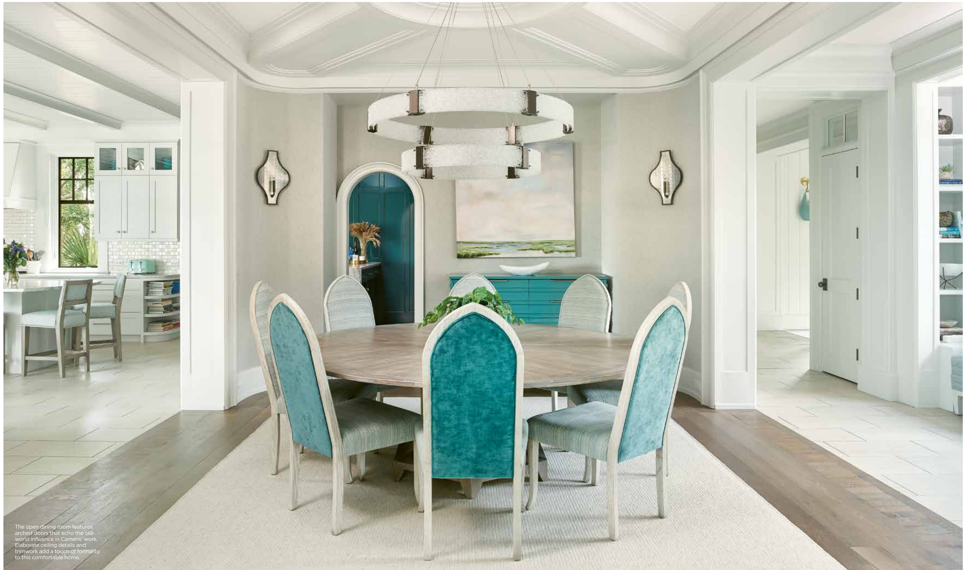
The open dining room features arched doors that echo the old-world influence in Camens' work. Elaborate ceiling details and trimwork add a touch of formality to this comfortable home.