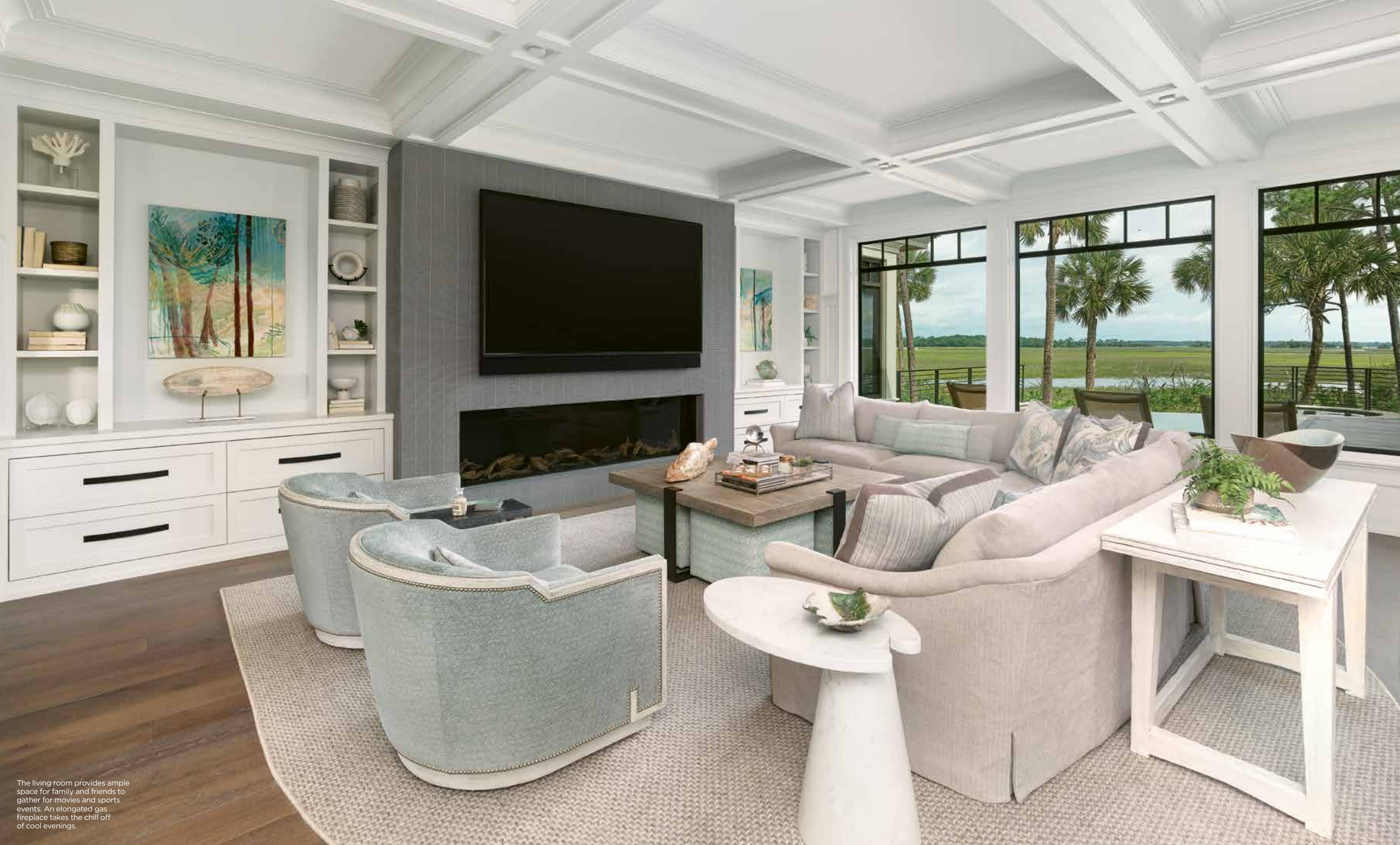
The living room provides ample space for family and friends to gather for movies and sports events. An elongated gas fireplace takes the chill off of cool evenings.